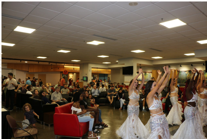
FSU Belly Dancers Perform at the Opening of the Middle East Film Festival

Jan 24 Global Cafe at the Center of Global Engagement (in cooperation with the Lebanese Social Club) A food reception was held where delicious Lebanese food was served. Over a hundred people enjoyed the good food and vibes.