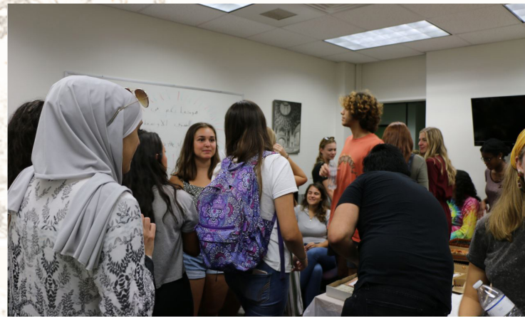
Students chatting and enjoying their time during Pizza Night held at MEC

Last year marked the 11th anniversary of the festival. We had a wide range of award-winning movies spanning across different parts of the Middle East in order to celebrate the region's cultures, diversity, and strengths. A reception took place on the opening night with free food, live music, and dance performances from different local groups and student organizations. This event was free and open to the public.