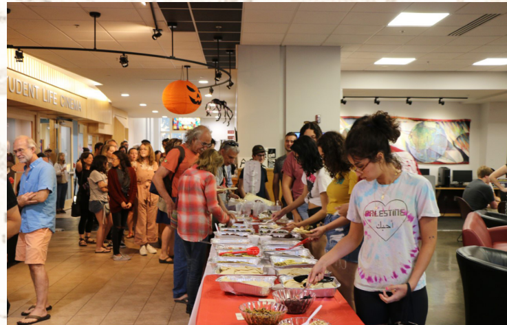
Opening Night of the Middle East Film Festival