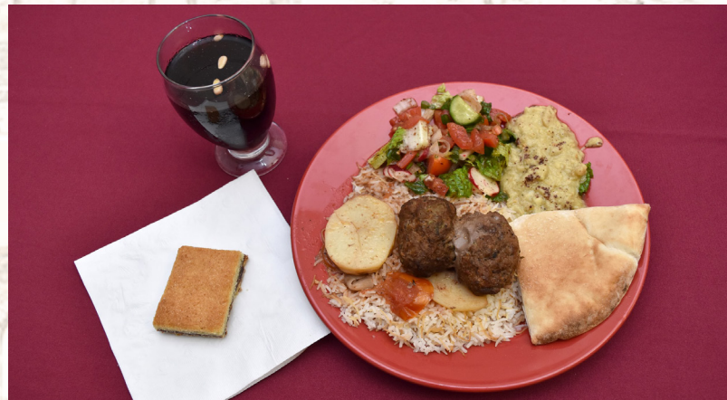
Food served at the Global Cafe