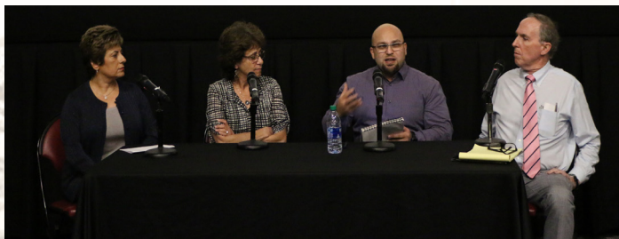
Round table discussion after "A Thousand Girls Like Me"